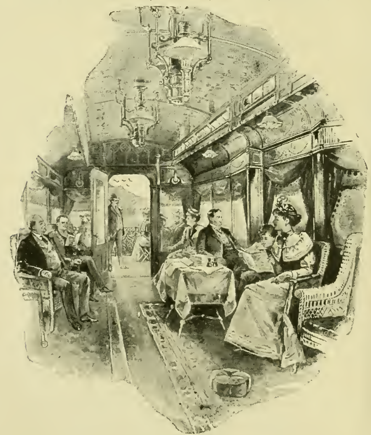
OBSERVATION CAR, "GOLDEN GATE SPECIAL."

without care for baggage or thought of train connections, are carried rapidly and comfortably through to their destination. Whether this be Washington, Old Point Comfort, Florida, Canada, Mexico, or