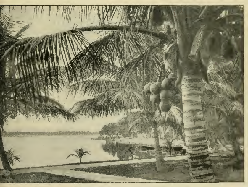
A GLIMPSE OF TROPICAL FLORIDA.

Tickets for the third tour cover Pullman accommodations and meals on going trip only; returning, nothing but transportation on regular trains is included.